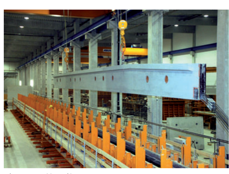
Lifting out a gable roof beam

Several 40-tonne double-girder bridge cranes are installed in order to enable the setting up of the formwork as well as the subsequent lifting out of the finished parts.