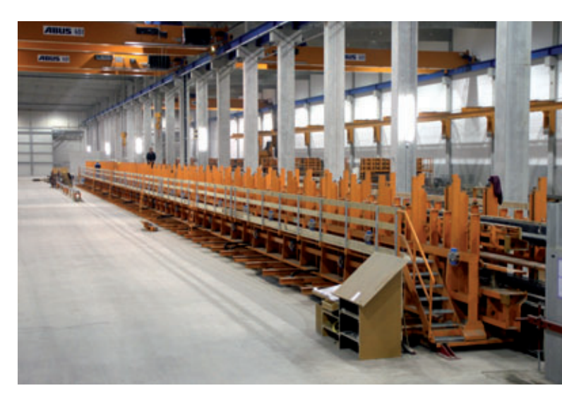
Overall view of the 99 m long universal formwork