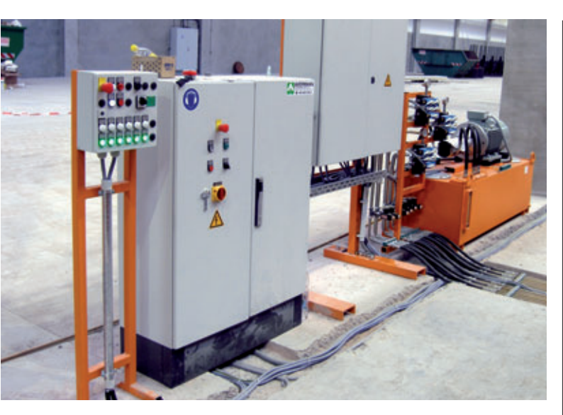
Operating station with hydraulic and vibrator control