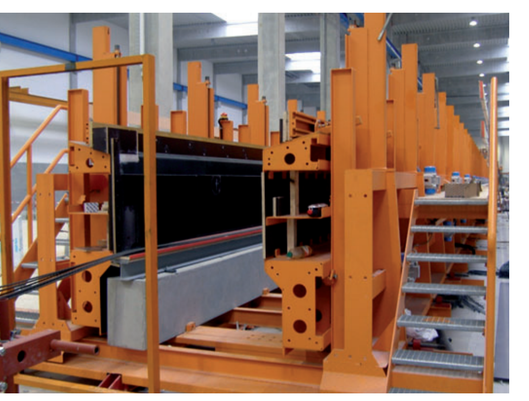
Formwork with hook-in parts for beams

Due to the extreme formwork length of 99 m, 4-5 identical elements can usually be manufactured in parallel in the universal formwork, depending on the dimensions of the concrete parts. This allows even large quantities to be supplied within the shortest time.