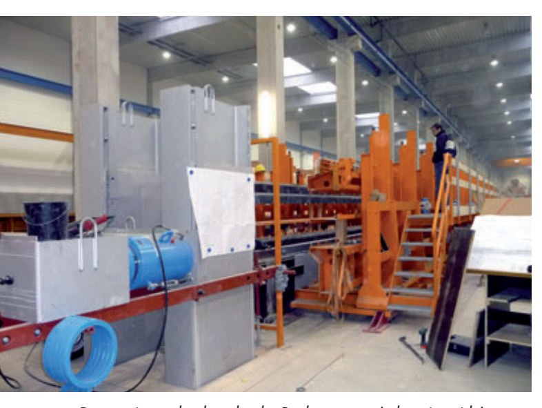
Prestressing technology by the Paul company (relaxation side)