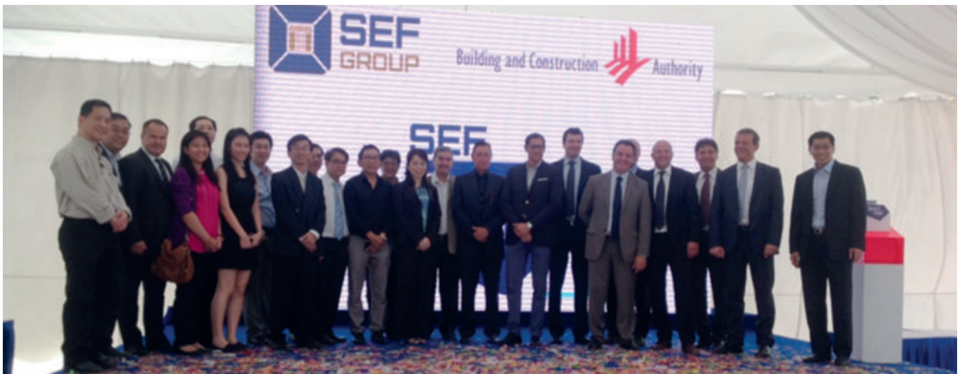
SEF Construction will put a multi-storey production centre for precast concrete elements into production in 2014

The vision of the government of Singapore is to lead its nation to a carefree and comfortable future. Part of this mission is to cover and expand the housing needs of the population with 700,000 new apartments over a period of 5 to 10 years. On account of this goal the responsible authority, the Building & Construction Authority (BCA) issued an invitation to bid for the first precast hub at the beginning of 2013. The requirements within the framework of the invitation to bid encompassed environmental compatibility aspects and modern production technologies on the one hand and cost analyses and innovations in precast technology on the other.